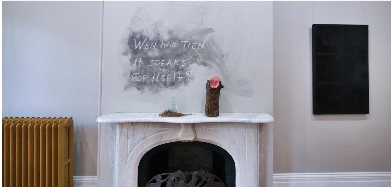
Installation image of Wen-hao Tien: It Speaks for Itself? On view at Gaslight Gallery (2022)